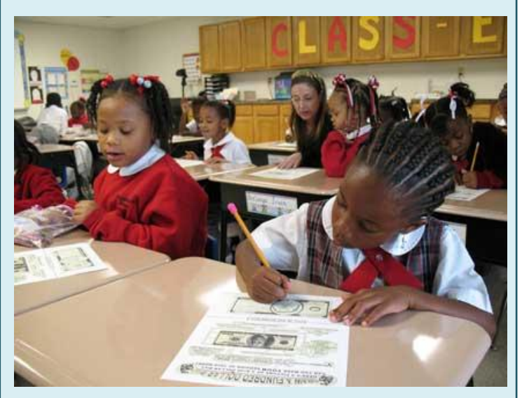
Children making Fundred bills as part of Mel Chin's Paydirt project.

Draw your unique Fundred Dollar Bill, mail it to a Fundred Collection Center and be part of the solution to eliminate the devastating effects of lead-contaminated soil that currently places children at risk for severe learning disabilities and behavioral problems. This nationwide drawing project will honor the value of your action. Make a Fundred! Make a Difference! These valuable drawings will be picked up by a special armored truck and presented to the U.S. Congress with a request for an even exchange of the creative capital—your Fundreds—for real funding to make safe lead-polluted soils in New Orleans. Once we create a lead-safe New Orleans, this innovative environmental model will be available to other lead-polluted cites.