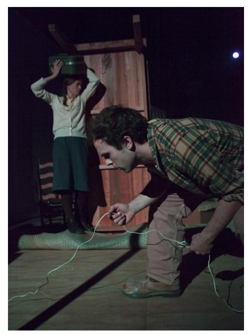
Runnin' Down the Mountain, NEW NOISE.

The <u>Network of Ensemble Theaters</u>' <u>MicroFest</u> came to New Orleans to discover the city's secrets and insights and