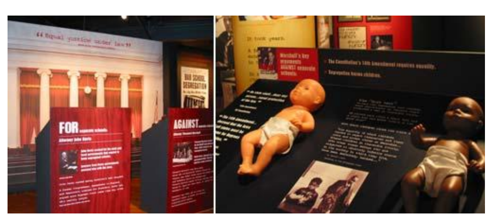
From the exhibition, COURAGE: The Carolina Story That Changed America , Levine Museum of the New South.

The Levine Museum's 2004, exhibition, Courage: The Carolina Story that Changed America , marked the 50<sup>th</sup> anniversary of America's landmark school desegregation case. The exhibition made space for citizens of Charlotte, NC to examine issues of equity, race, and inclusion in