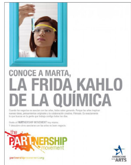
Spanish language versions of the pARTnership Movement ads.