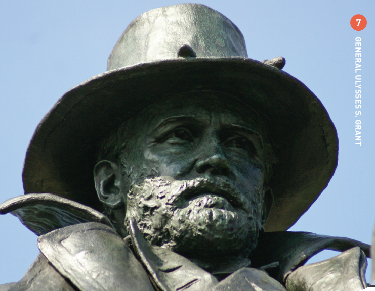
7 GENERAL ULYSSES S. GRANT