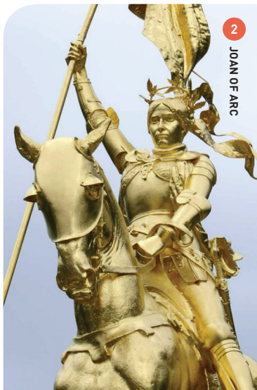
2 JOAN OF ARC