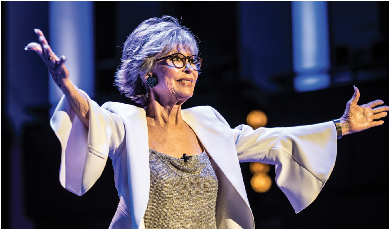
Rita Moreno delivers the Americans for the Arts 32nd Annual Nancy Hanks Lecture on Arts and Public Policy.

RITA MORENO: Wait a minute, I just have to say I need to say my thank you, Señora Justicia, and you said something that really shocked and alarmed me about me, about you and me. Were you really seven when you saw that?