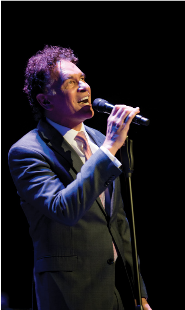
Tony Award winner and Americans for the Arts Board Member Brian Stokes Mitchell presents a dedicated performance along with opening remarks.

T hank you so much, good evening. I am feeling good tonight, definitely. I hope you're feeling good, too. It feels good to be down here at this time with fellow arts makers and creators and supporters. And I'm glad we're all here together at the same time and in the same space trying to do something, help out the arts a little bit. So, thank you all so much for being here and being a part of this.