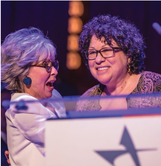
Justice Sonia Sotomayor introduces her friend and fellow Puerto Rican Rita Moreno as the 2019 Nancy Hanks Lecturer on Arts and Public Policy.