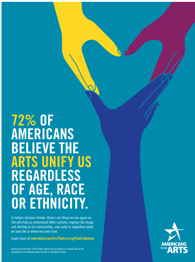
Americans for the Arts ad placed in targeted newspapers across the country and online.

justice, Americans understand that even in challenging times, the arts make our communities healthier, stronger, and more unified.