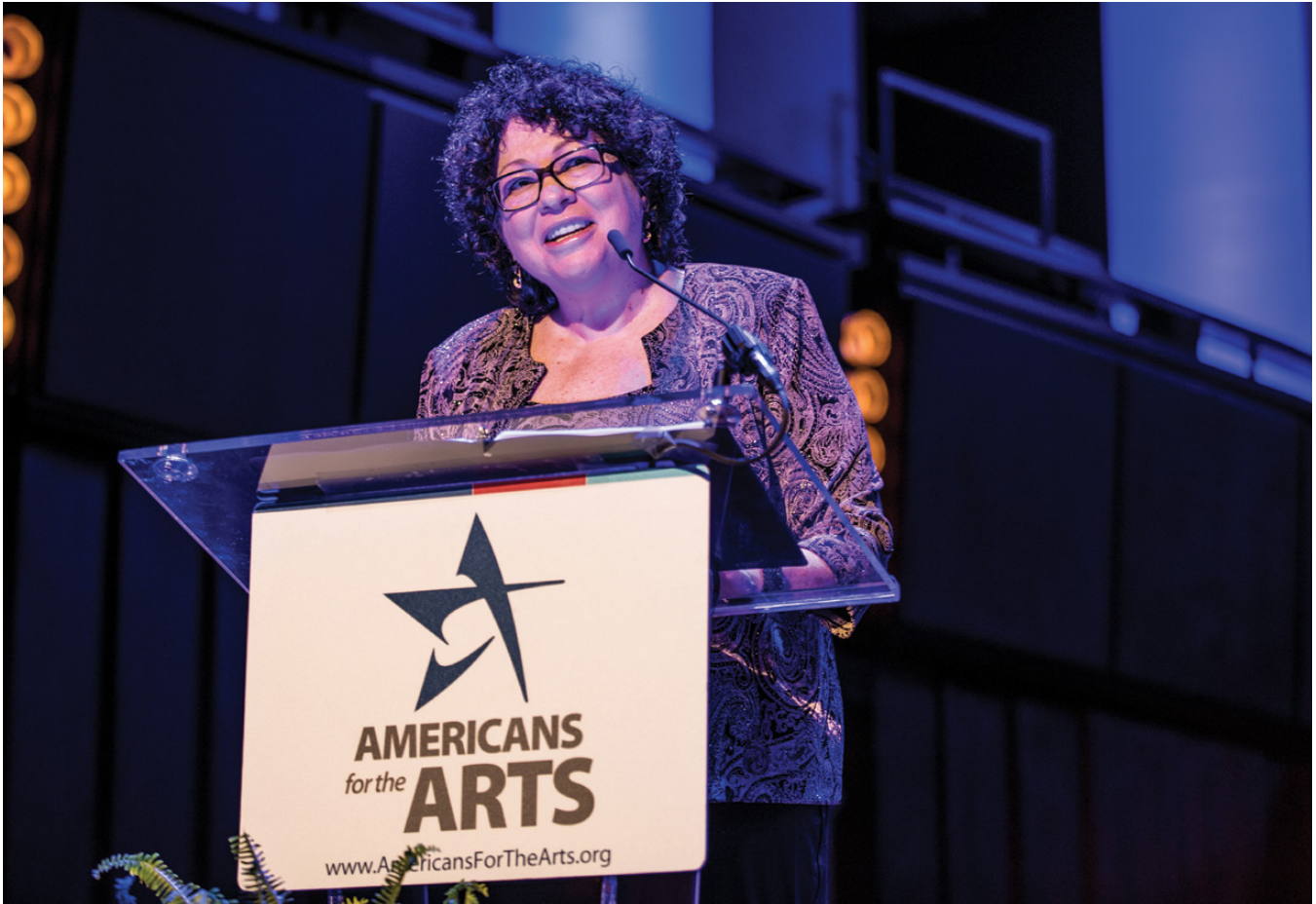
United States Supreme Court Justice Sonia Sotomayor introduces her friend, Rita Moreno.