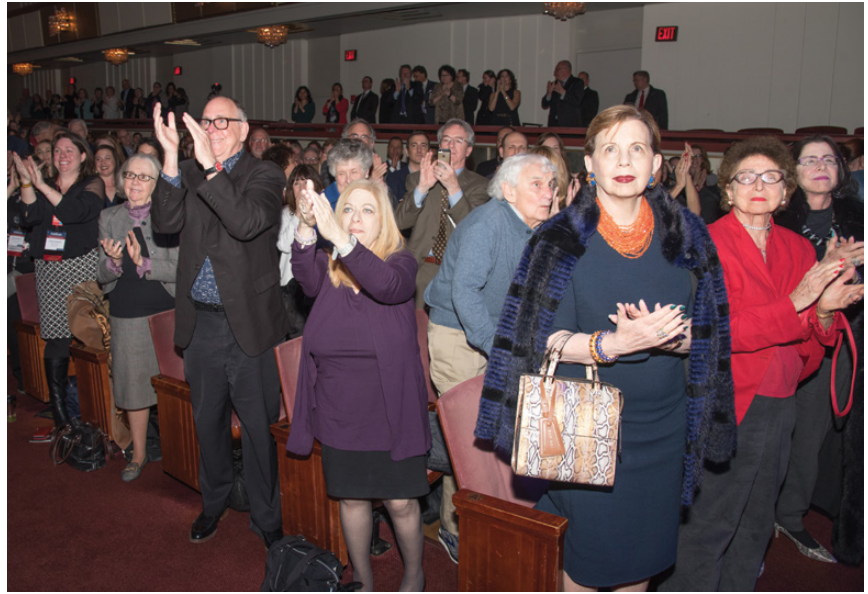
Rita Moreno takes a bow as she receives a standing ovation for her inspiring Nancy Hanks speech to a packed audience of 2,000 guests.

leaves us in the air, right in mid-air. Art can paint stories in the movement of a score, the dialog of a play, the choice of a word, the selection of a color, the electricity of a dance. Art invites us out of our enclaves to talk across division, to tear down walls. It teaches us the discipline of listening. Art claims the dulcimer of Appalachia, the cello of Yo-Yo Ma, it's the poetry of Whitman and the rap of Chance, the step-ball-change of jazz and the en pointe of ballet, it's the opera of the Met and the Grand Ole Opry, the movie of a Steven Spielberg and the play of a Tony Kushner. It's a Louisiana gospel and a Chancel Choir uptown. The arts provide a smorgasbord of choices from high tea to a cup of joe. The "Hallelujah Chorus" and "We Shall Overcome." Art is nourishment for the soul, it's a mirror held up to show us who we are and who we can become.