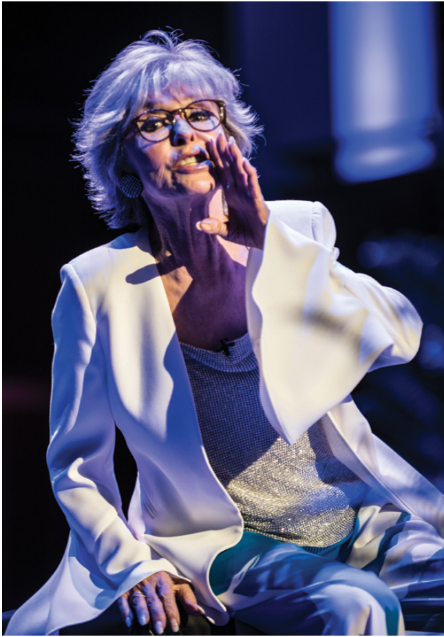
Rita Moreno shares personal stories of her trailblazing years to break through typecasting in Hollywood.

those steps in 1963. Up until that time in my career, the studios had cast me to play every kind of ethnic role, Polynesian girl, Indian princess, Arabian girl, or any dark-skinned girl they needed. I hated those parts. I now refer to them as my dusky maiden roles. I had to deliver lines to my white lover like, “Why you no love Ula no more?”