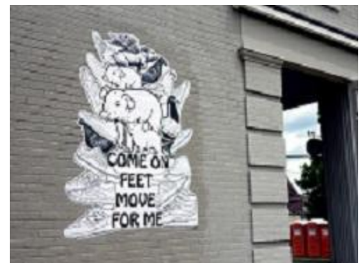
Image from Cincinnati's Flying Pig Marathon