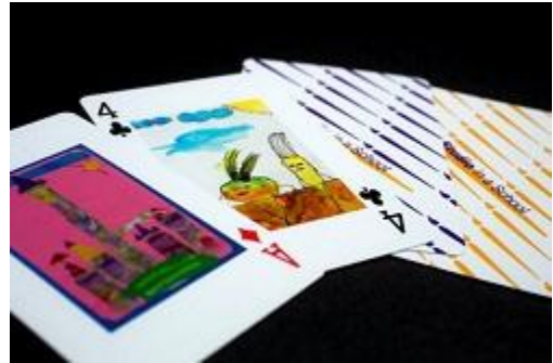
Studio in a School, a charity founded by philanthropist Agnes Gund