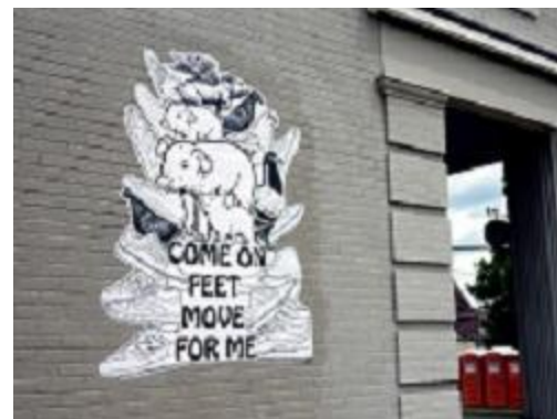
Image from Cincinnati's Flying Pig Marathon