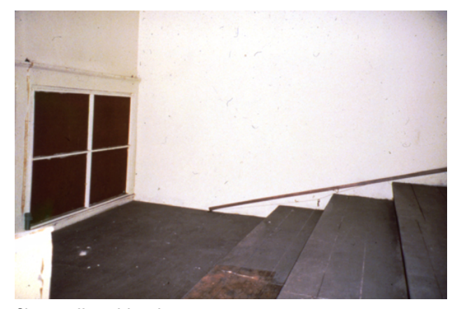
Slave gallery bleachers