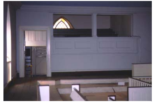
View of one of the slave galleries from the church balcony

In 1999 the Committee asked the Lower East Side Tenement Museum, with whom they had a long relationship, to bring its experience with research, preservation, and interpretation to the project. The museum agreed to conduct fund raising, to develop and direct a team of preservation architects, consulting historians, and researchers, and to commit its own interpretive staff.